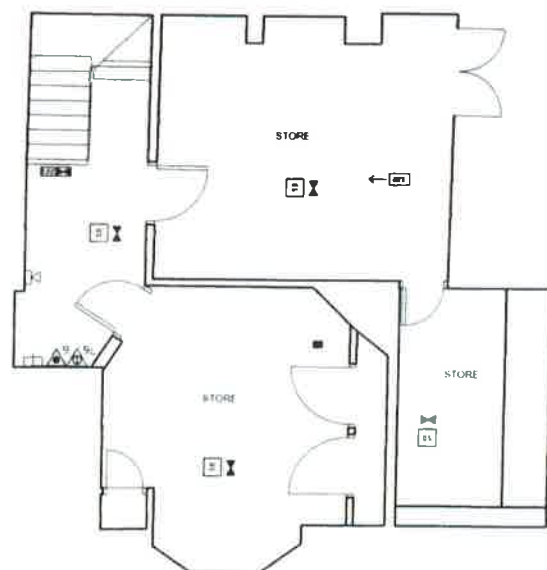
B BASEMENT FLOOR PLAN SCALE 1:50@A1